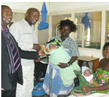
BABIES ON CHRISTMAS

TRAININGS : With funding from ICCO through health office 165 hospital health workers were trained on sexual reproductive health majoring on customer care, communication ,rights of patients and attitude of health workers toward patients. The training was to equip participants with knowledge and skills so as to reduce maternal and neonatal deaths.