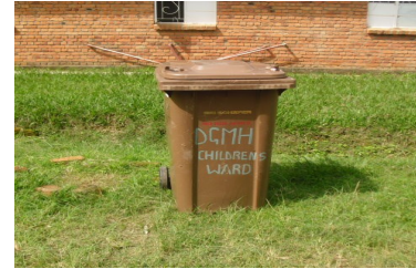
REFUSE BIN AT PAEDIATRICS WARD

The refuse bins have been labeled and located in the wards. The bins were donated from Scotland.