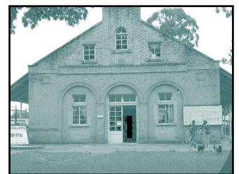
Main entrance to the hospital

At present the hospital has grown to 135 bed capacity in four wards. It has an average daily bed occupancy of 65 patients. It caters for referral population of about 90,000. Our Out Patient Department sees about 45 patients every day. We operate in a community heavily laden with disease and pov-